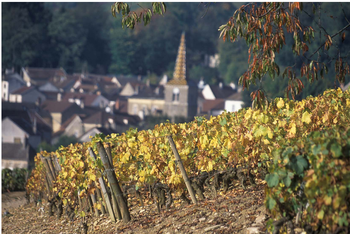
BONNEAU DU MARTRAY