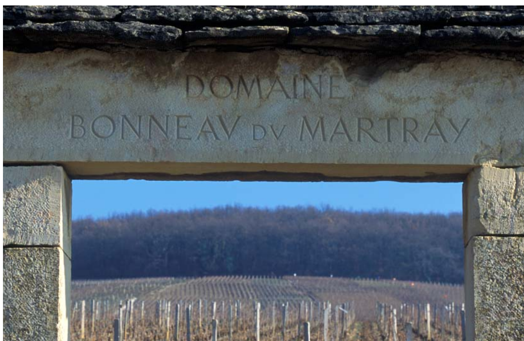
BONNEAU DU MARTRAY

92-95: "A very subtle hint of wood frames the restrained, airy, cool and very fresh nose of green apple, citrus and lightly spiced pear aromas that introduce intensely mineral-driven flavours that possess a mouth feel of pure silk. There is ample dry extract that buffers well the very firm and bright acidity that supports the transparent, long and refined finish. This is beautifully well-balanced and while it's very early on, this appears that it will reach its apogee somewhat sooner than is typical." Burghound