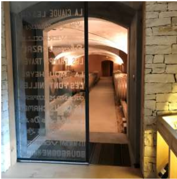
Barrel cellar at Domaine Anne Gros