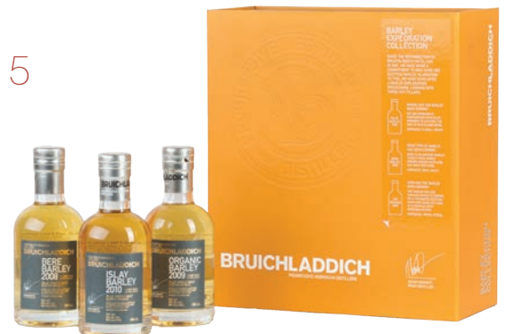
5 BRUICHLADDICH WHISKY 96449 WEE LADDIE GIFTPACK 3x 600ML $125.50

A sweetly-packaged collection containing three 200ml bottles of Malty genius. Together, they make the perfect introduction to the brilliance of Bruichladdich's superb single malt whiskies.