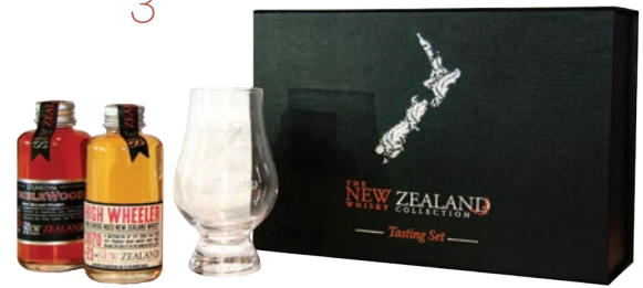
3 NZ WHISKY TASTING GIFTPACK 93379 2X WHISKY 200ML & GLASS GIFTPACK $79.99

This nifty Kiwi-produced whisky pack contains 100ml bottles of 21YO High Wheeler and the gold medal-winning 16YO Dunedin DoubleWood, complete with tasting glass.