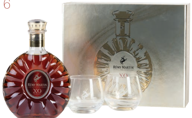
6 REMY MARTIN COGNAC 700ML 92399 XO AND PREMIUM GLASS PACK $299.00

The Remy XO is aged for up to 35 years, with the grapes taken only from the two best crus. Graced with a floral bouquet and a delicate hint of oak. With two glass tumblers.