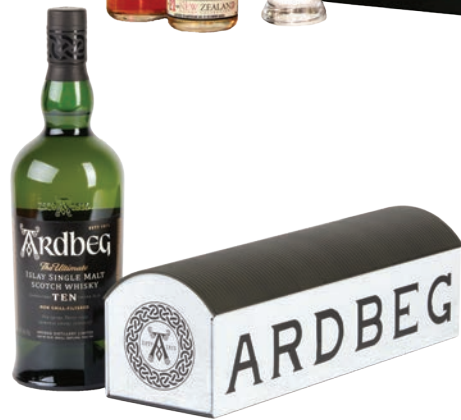
4 ARDBEG WHISKY 700ML 93275 10 YEAR OLD WAREHOUSE PACK $99.00

Ardbeg is stunning, a helter-skelter explosion of peat and toffee and, in behind, that subtle medicinal character that Islay fans cross oceans for.