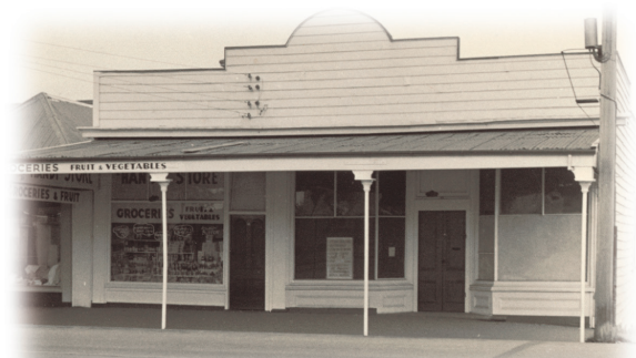
THE JERVOIS ROAD SITE, CIRCA 1945