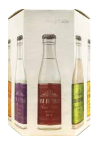
EAST IMPERIAL TASTING CASE 150ML 7-PACK