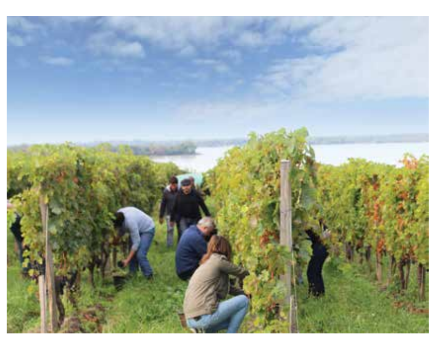
CHÂTEAU MARQUISAT LA PÉROUSE

Vegan is a pretty common term these days, so most of us are aware that the vegan diet accommodates no animal products whatsoever. The reason not all wines are vegan- or vegetarian-friendly is down to the way a wine is clarified – that is to say, made clear and bright – via a process known as 'fining'. Young wines naturally contain proteins, tartrates, tannins and phenolics. These are in no way harmful, and most wines will eventually self-clarify. The main reason wines are fined in the first place is because we wine drinkers don't generally like a glass of something that's hazy or cloudy. To hasten the clarifying process, many winemakers use fining agents. The most common of these are casein (milk protein), albumen (egg white), gelatin (animal protein) and isinglass (fish bladder protein). Some winemakers are now opting for animal-friendly alternatives such as carbon, bentonite clay, limestone, kaolin clay, plant casein or silica gel. For those who are interested, labels are increasingly becoming more specific about the fining and filtering agents used. And then there are those who undertake no fining at all and offer their wines unfiltered.