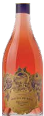
TERRA SANCTA CENTRAL OTAGO 19979 SPECIAL RELEASE FIRST VINES ROSÉ 2019 $45.99

Sourced off some of NZ's best old Pinot Noir vines on the famed Felton Road. A fragrant nose of rose petals, raspberry, and herbs. The vines deliver real presence and a wonderful texture. A long, silky finish balances fresh acidity, savoury characters and delicate fruit.