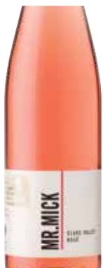
MR. MICK CLARE VALLEY 23401 ROSÉ 2019 $13.99

Tim Adams Wines have emerged as one of the Clare Valley's leading producers, the wines exuding elegance and a sense of place. Fruit-forward and friendly, this smart rosé is popping with raspberry and strawberry notes overlaid with hints of lychee and white peach.