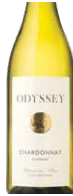
ODYSSEY GISBORNE 15894 CHARDONNAY 2019 $18.99

A luscious and fruity, smooth-drinking Chardonnay with ripe stonefruit, mango and citrus flavours. The palate is smooth and rounded, with excellent richness nicely framed with soft acidity. A creamy mouthfeel with a long, sustained finish.