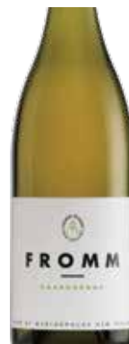
FROMM MARLBOROUGH 12870 CHARDONNAY 2018 $39.99

A complex wine with multiple layers of ripe fruit and richness, displaying a chalky minerality on the nose. The palate combines good weight and balanced acidity with a tight yet generous structure. A long, lingering citrus finish with savoury nuances.