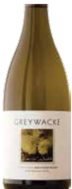
GREYWACKE MARLBOROUGH 13820 SAUVIGNON BLANC 2019 $24.99

Greywacke's Kevin Judd directed the first 25 vintages at Cloudy Bay. Flinty, mineral, with some reductive French characters, this is rich and concentrated, the power beautifully contained. Sourced from 90% organic vineyards using natural ferments and minimal intervention.