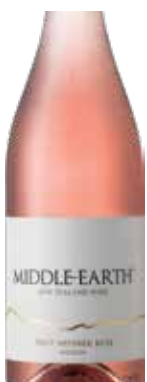
MIDDLE-EARTH NELSON 11591 PINOT MEUNIER ROSÉ 2019 $18.99

A fragrant array of plum and red berryfruit notes with dried herb and subtle earthy nuances accompanies a generous, layered palate of red fruits, ripe cherry, plum and spice. Finishes soft and long. Cellar this for a few years, if you can, to realise its potential.