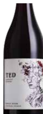
MOUNT EDWARD CENTRAL OTAGO 12529 TED PINOT NOIR 2018 $29.99

Three generations of a sustainable winegrowing family operate Nelson's Middle-Earth. Their Pinot Meunier-derived rosé is vibrant and off-dry in style, with ripe, juicy cherry and cranberry characters enriched by spicy notes. A bright, tangy mouthfeel is augmented with fresh acidity and a touch of sweetness.