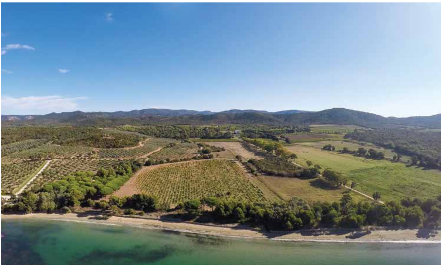
THE LÉOUBE ESTATE