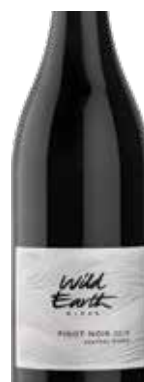
WILD EARTH CENTRAL OTAGO 16021 PINOT NOIR 2018 $32.99

Sourced off some of NZ's best old Pinot Noir vines on the famed Felton Road. A fragrant nose of rose petals, raspberry, and herbs. The vines deliver real presence and a wonderful texture. A long, silky finish balances fresh acidity, savoury characters and delicate fruit.