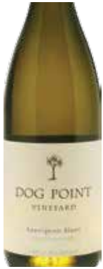
DOG POINT MARLBOROUGH 18390 SAUVIGNON BLANC 2019 $24.99