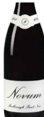
NOVUM MARLBOROUGH 16507 PINOT NOIR 2018 $42.99

Tim Adams Wines have emerged as one of the Clare Valley's leading producers, the wines exuding elegance and a sense of place. Fruit-forward and friendly, this smart rosé is popping with raspberry and strawberry notes overlaid with hints of lychee and white peach.