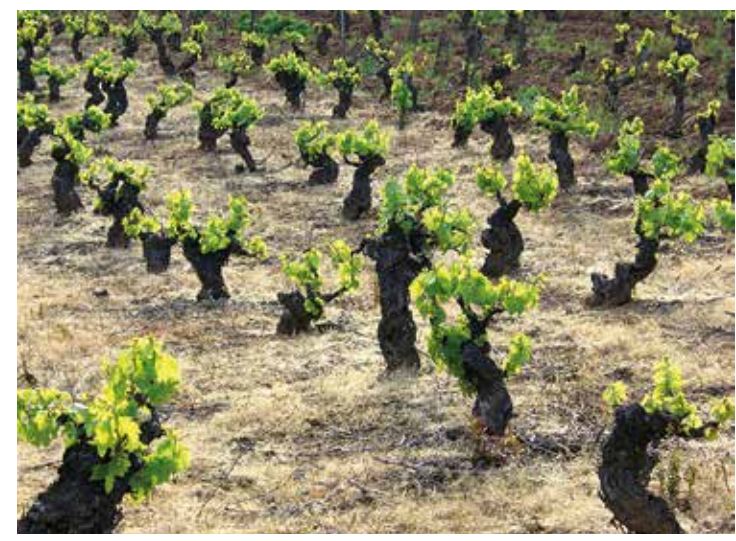
DOMINIO DE TARES

Established in the 1990s and widely considered to be one of the most exciting wineries within the Bierzo D.O., Dominio de Tares are infants in Spanish wine terms, but giants in their approach, using ancient vineyards and painstakingly artisan-like practices to bring to bear Bierzo expressions as pure and characterful as can be coaxed from the multiple microclimates in which they operate. With a fierce focus on improving vintage by vintage and harnessing some of the best oenological minds in Spain, they are a benchmark winery for their practices. Their goal is to introduce to the world the virtues of the ancient, indigenous Mencía variety, and their first wines, released in 2000, gained universal acclaim. The Dominio de Tares wines represent a pure expression of terroir that have, along with the likes of Alvaro Palacios, put Bierzo firmly on the global wine-map.