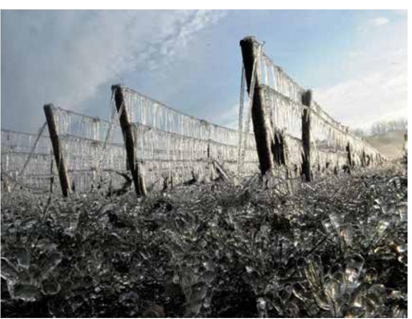
SÉGUINOT-BORDET'S PREMIER CRU FOURCHAUME VINEYARD

Brilliantly priced wine from the King of Beaujolais. Produced from the strong and fruity Gamay variety, the Villages model is mid-range Beaujolais, a step up from the Nouveau. Soft, fruity and succulent.