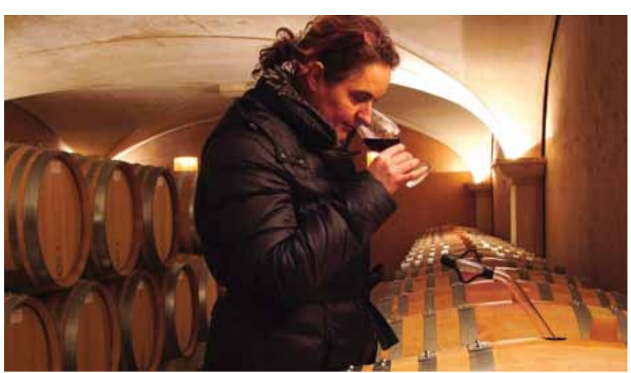
GROS-TOLLOT'S ANNE GROS

42187 LE JARDIN DE PETIT VILLAGE POMEROL 2009 WAS $89.00 $59.99