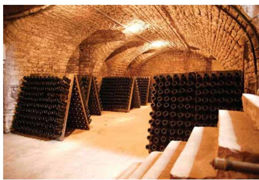
CHAMPAGNE MOUTARD CELLARS

Made just outside Champagne, delivering the same varieties via the same method, but for a fraction of the price. Slightly drier than its sister wine, the Saint-Meyland, it exhibits the same hallmarks of quality.