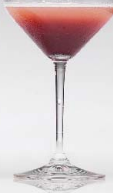
Mint Moscow Mule