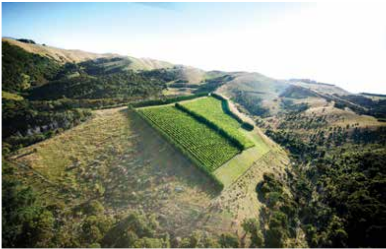
MAN O' WAR SYRAH, CLIFFS VINEYARD

The northern Rhône's Hermitage appellation is home to the world's greatest Syrah-based wines, with Jaboulet's La Chapelle vineyard considered one of the region's finest. The vines are ancient, the nose darkly sweet and complex, the palate gorgeously lush and silky.