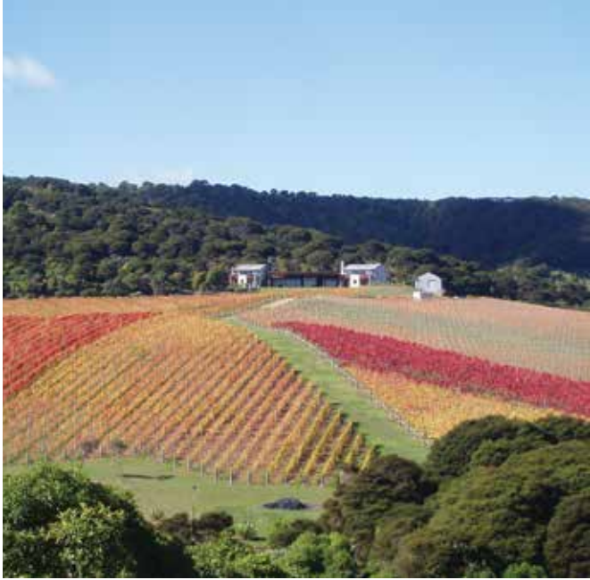
SOHO, WAIHEKE ISLAND