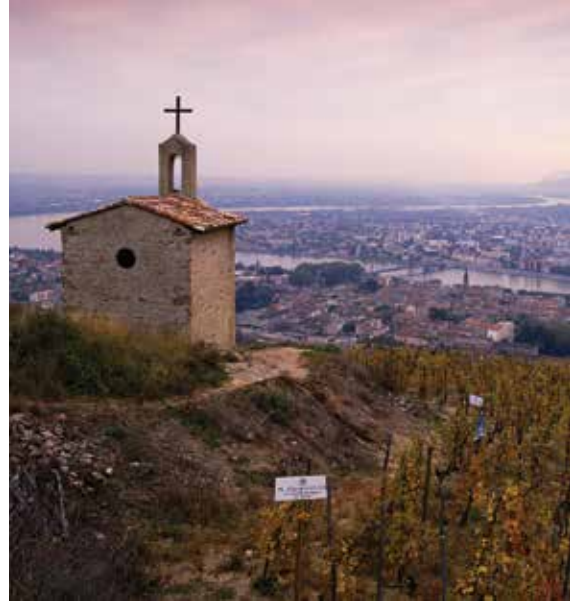
LA CHAPELLE, HERMITAGE HILL

Off Man O' War's steep hillside Syrah vineyards, the Dreadnought is a vibrant blend of power and elegance with its rich palate of spiced, earthy black and blue fruits, streak of acidity and mineral edge.